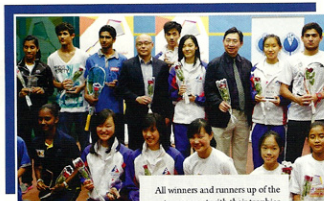
All winners and runners up of the tournament with their trophies