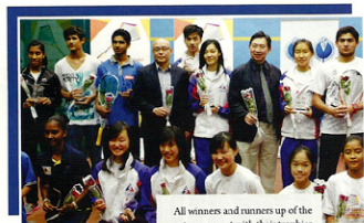
All winners and runners up of the tournament with their trophies