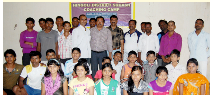
Officials of Hingoli Squash Racket Association and SRAM along with the participants of the camp