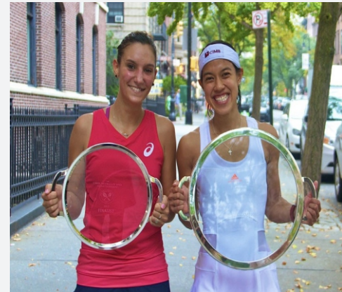
Nicol David and Camille Serme with their trophy

Nicol David Celebrates Carol Weymuller Double