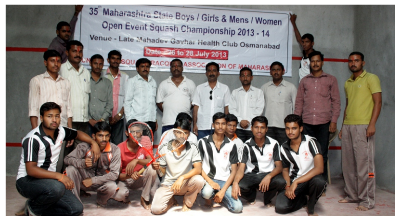
Officials of the tournament along with the winners and runners up

ISP organised 35th Maharashtra State Sub-Junior and Senior championship at Late. Mahadev Gavhar Health Club Osmanabad from 26th to 28th July 2013.