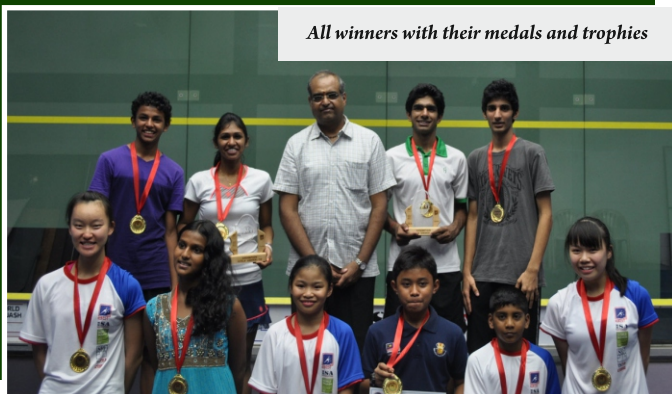
All winners with their medals and trophies

at Indian Squash Academy, Chennai (31/08/2013)