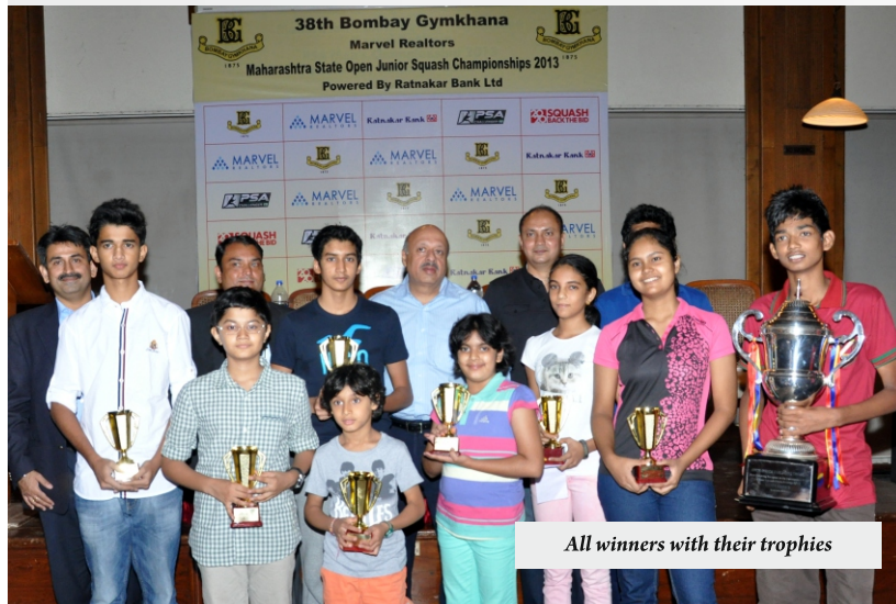
All winners with their trophies

at Bombay Gymkhana (17th September 2013)