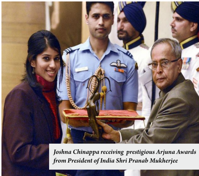
Joshna Chinappa receiving prestigious Arjuna Awards from President of India Shri Pranab Mukherjee