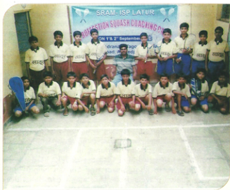
Free coaching seminar, at Latur District