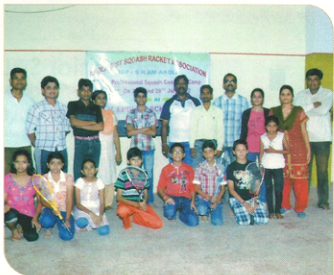
SRAM-ISP free coaching camp, at Akola