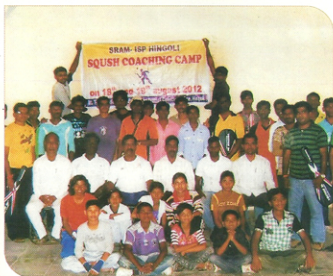
Squash Coaching Camp, at Hingoli District