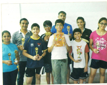
All winners of the event with their trophies and gifts

S RAT (Squash Racquets Association of Thane District) successfully organised the Open Squash tournament in Thane. The tournament had five categories namely Mens Open, Womens Over 30, Mixed U-17, Mixed U-13 and Mens Over-40. In all there were more than 70 matches played across these categories, with participants coming from all across Thane & Mumbai. The matches were held over two days on July 28 & 29, 2012 at the Hiranandani Estate Club House Squash Courts.