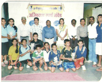
34th Maharashtra State Junior Open, at Nanded