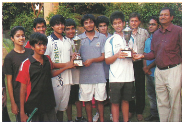
All winners with their trophies

This tournament was held on 26th and 27th April at one of the most scenic locations near Delhi, atop the Aravali hills and in the grand premises of the Pathways school. The competition was held in 2 age groups U-15 and U-17 and the participating schools like Modern Barakhamba, DPS R K Puram, Hamdard, and Ahlcon International had a tradition of squash, while Pathways, Kendriya Vidyalaya, R K Puram, Step by Step International (Jaipur) and Sanskriti were the new entrants. The Pathways management was gracious enough to let the team stay 2 nights at their plush apartments used as dormitories with all meals included, in one of the best self service cafeterias in the country.