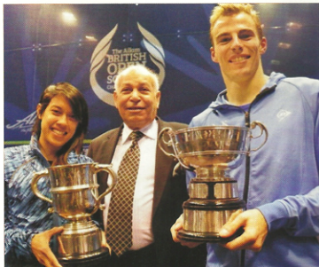
Nicol David (Mas) and Nick Matthew (ENG) with their trophies

N ick Matthew overcame fiery Egyptian Ramy Ashour in straight games in the final of the Allam British Open to secure his place in history as the first Englishman to win the world's most famous squash title for a third time.