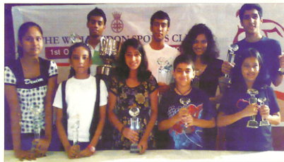
All Winners with their trophies at the event

Six titles for Maharashtra, one for Goa and two for TN