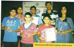
All winners with their trophies at the event