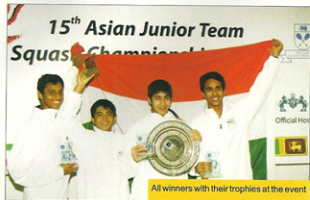
All winners with their trophies at the event

The rapid growth of squash in India took another major step forward when the country's boys team upset arch rivals Pakistan, the title-holders, in the final of the Asian Junior Team Championships in Colombo, Sri Lanka, to win the prestigious title for the first time since the inception of the championships in 1981.