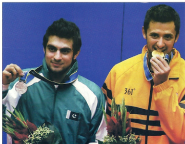
Gold medal winner Mohamad Azlan Iskandar and silver medal winner Aamir Atlas Khan of Pakistan take part in the medal ceremony for the men's singles squash event at the 16th Asian Games in Guangzhou

Malaysia, Pakistan wins Gold, while India men and women team settle for bronze