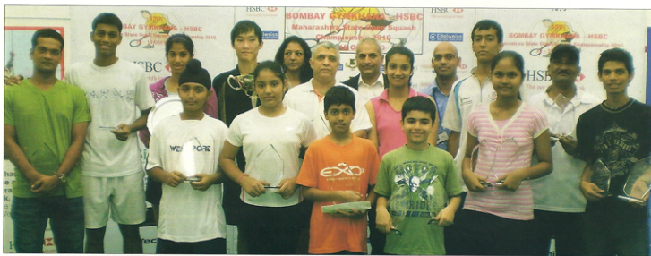
All Winners with office bearers of Bombay Gymkhana at the event