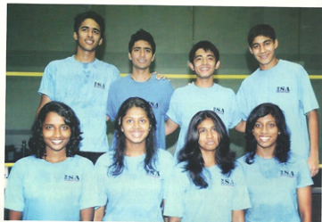
The participating team at the event

T amil Nadu made a clean sweep of the boys' and girls' (under-19) titles in the National junior inter-State squash tournament.