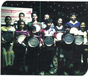
All the winners with their trophies