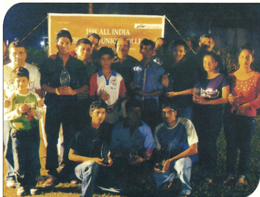
All the winners with their trophies along with the office bearers of Jindal Steel Works and Indian Squash Professionals