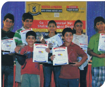
All the winners along with their trophies at the event