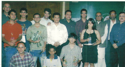
Mr. Digvijay Singh (General Secretary, All India Congress Committee and former National Squash Player) along with the winners of All India ISP-Sprite Squash tournament held in R.K. Puram, Kendriya Vidyalaya, New Delhi.