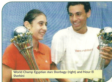
World Champ Egyptian stars Shorbagy (right) and Nour El Sherbini