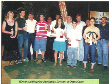
Winners at the prize distribution function of Otters Open