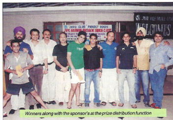
Winners along with the sponsor's at the prize distribution function