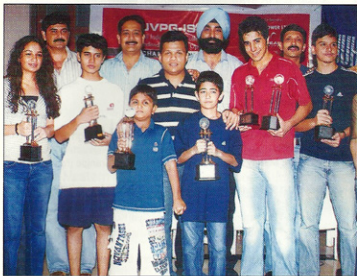
At the prize distribution function winners along with the office bearers of JVPG Club and Indian Squash Professionals.

The most popular Squash event for Juniors in Mumbai—the All India School College Championship moved to Juhu Vile Parle Gymkhana this year from Khar Gymkhana. The preparation time for ISP for organizing the event and the manpower available was limited, so the scale of the event was smaller than earlier. Following the event, a new design of draws which is extremely easy to read, and a panel of members for the seeding has been evolved. In the Entry Forms for subsequent ISP events, a place for comments about the player entering has been created, in addition to space for making suggestions.