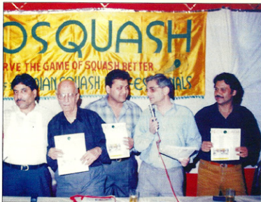
Launching of Prosquash Magazine