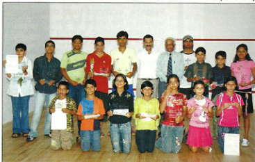
All winners along with the management of JSW

The first JSW-Karnataka State open squash championship was held at the Jindal Vijaynagar Sports Complex, Vijaynagar Works, Bellary, Karnataka from June 28 to July 1.