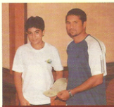
Vikram Malhotra with Sachin Tendulkar