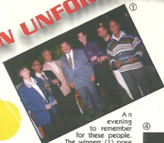
① An evening to remember for these people.