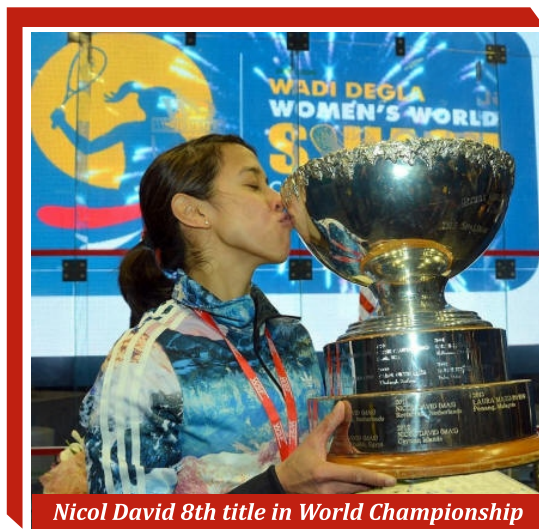
Nicol David 8th title in World Championship