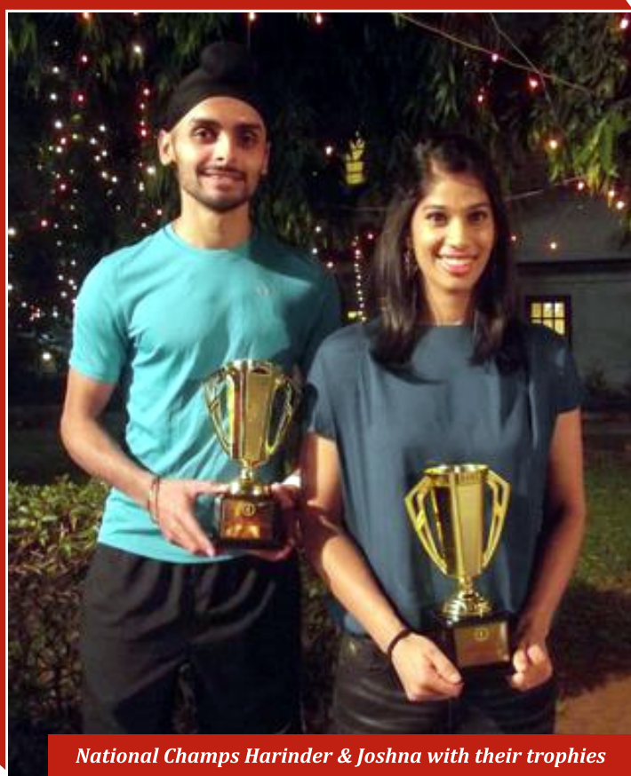
National Champs Harinder & Joshna with their trophies

Third seed Harinder Pal Singh Sandhu dethroned favourite Saurav Ghosal for his maiden national men's crown, while Joshana Chinappa helped herself to her 13th women's title, in the 62nd Senior National Squash Championship, at the Cricket Club of India.