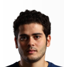
Karim Abdel Gawad