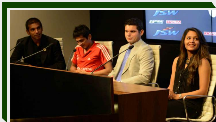
A glimpse of press conference

India will stage its first professional squash circuit in October including four Women's Squash Association World Tour events, according to an announcement made in Mumbai.