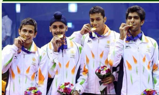
Men's team event gets 1st ever gold

At Incheon, South Korea (23rd September 2014)