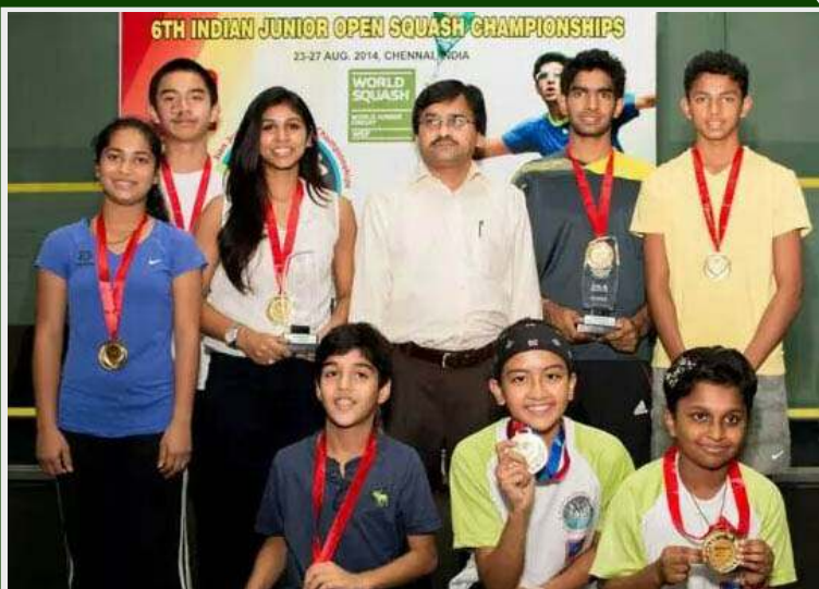
The winners posing their trophies and medals at the event.

At Indian Squash Academy, Chennai (27/08/2014)